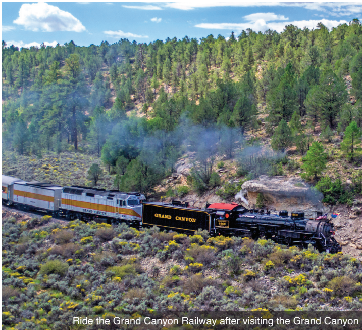
Ride the Grand Canyon Railway after visiting the Grand Canyon

DAY 5 Verde Canyon Railroad: This morning, stop in Jerome, an old mining town and melting pot for those who dreamed of making a quick fortune. Once virtually a ghost town, it is now restored with shops, museums and art. Later, climb aboard the Verde Canyon Railroad for a spectacular journey over old-fashioned trestles, past ancient Indian ruins and through a 700-foot tunnel. Enjoy the views from the comfort of your First Class seat or from one of the open-air viewing cars. Watch for wildflowers, blooming cacti and wildlife in their natural habitat. Tonight, chow down with a chuckwagon supper at the “Blazin’ M Ranch” and Western Stage Show. Meals: B, D