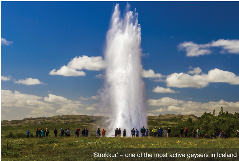
'Strokkur' – one of the most active geysers in Iceland

Enjoy free time for lunch on your own and shopping, then prepare to “take off” as you visit FlyOver Iceland. During this virtual flight, experience waterfalls, geysers, scenic landscapes, and the spectacular natural wonders of Iceland like never before. With the special effects of motion, wind, sound and scents, this unique “flying” experience is sure to be a highlight of your day! Return to the hotel late afternoon for an evening at leisure. Meal: B