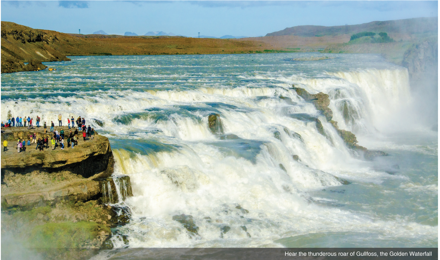
Hear the thunderous roar of Gullfoss, the Golden Waterfall