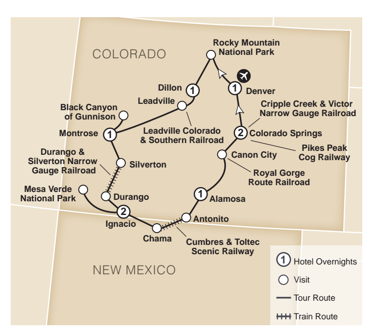
DAY 1 Arrive in Denver: Welcome to Denver, the "Mile High City." Meet your fellow travelers at 5:00 p.m. for a getacquainted dinner hosted by your Tour Manager. Meal: D

DAY 2 Rocky Mountain National Park: Departing Denver, venture into Rocky Mountain National Park, a living showcase of the grandeur of the Rocky Mountains. With elevations ranging from 8,000 feet on the wet, grassy valleys to 14,259 feet at the weather-ravaged top of Longs Peak, the park is filled with breathtaking scenery and experiences. Following the Trail Ridge Road a stop at the Alpine Visitor Center offers an opportunity to learn more about this fascinating place. Meal: B